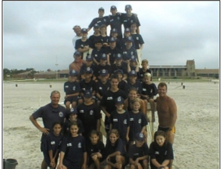
The future of the JBLC - Our Jr. Lifeguard Corps

THE RUN: The last topic to be discussed was the State's proposal for a run as a component of our rehire. We made it very clear that the Executive Board had rejected, flat out, the State's proposal for a half-mile run. At this time a quarter mile or shorter is being discussed. We have also made it clear that if the State wants to make the standard more difficult it MUST increase our pay to attract AND keep more Lifeguards. This is an integral component of this entire agreement. We currently have a meeting scheduled with the State for next week to discuss this further.