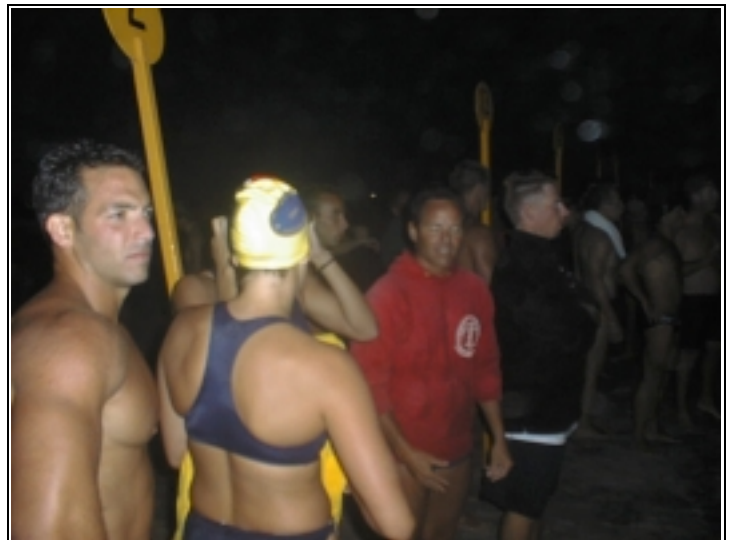
The night time Relay (Thank God for Headlights)

Everyday we fed him fish. We drilled a small hole in the shell and took him for walks on a leash. He was a big attraction at JB for about a week. We finally decided to let our friend return home. With great fanfare and pomp, oars raised, flags flowing and a lifeguard playing a trumpet, Mr. Turtle waddled into the sea. We swear that just before he went in he waved his big flipper at us. Can you hear him telling the other turtles, "You can't believe the wackos I was with last week."