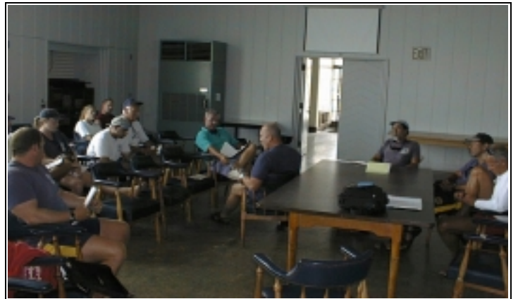
The Shop Stewards and the Executive Board meet

The next issue discussed was the difficulty that the new lifeguards have been experiencing getting new equipment. Due to an oversight the new rookies are getting the old non-waterproof uniforms and no raingear. The Executive Board promised they would fix this problem as soon as they have an opportunity to talk to the State. The same was said about the problem of having people from beaches other than Jones Beach having to pick-up uniforms at the storehouse in person. This procedure not only strips a beach of manpower but also acts as a great inconvenience for many. This too was promised to be addressed.