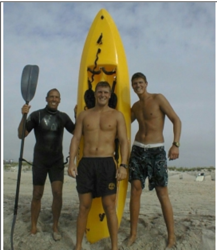
The World Famous Angermaier Surf Kayak Team

As you will read we have a Christmas party planned, a possible New Years Eve Party and a lot of news about negotiations. As this is being mailed out by our new database, I hope it reaches all. Please call your buddies to make sure they got their copies. Between old addresses and the US Mail I am never sure what gets where. See you at the party!!!