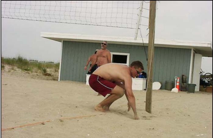
"Gee, Petey spiked it so hard into the sand I can't find it now."

RACES PARTY follows immediately thereafter!