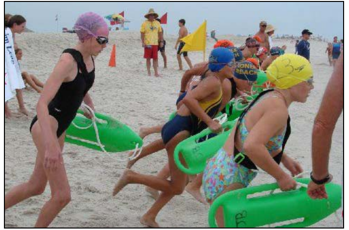
The JBLC Juniors dominating all other teams

Please note that RM 4 is closed to the public (no guests please - sorry) on these dates which means that you must show up on time (8:00 - 9:00 AM) in order to get in. If anyone is interested in showing up early to help set up it would be much appreciated. If you have any questions you can contact me at scottdavern@yahoo.com (how original, huh?). See you there!