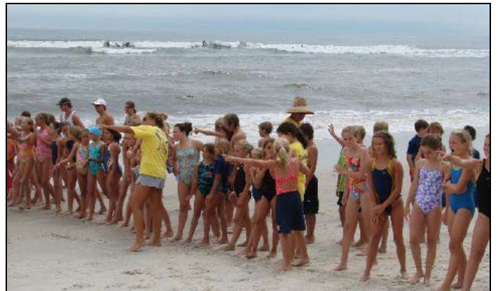
Taking the Jr on tour to show off their superior talents

This Thursday August 9th, 53 Jones Beach Juniors will be competing at the USLA National Lifeguard Championships in Myrtle Beach, South Carolina. Best of luck to all competing!