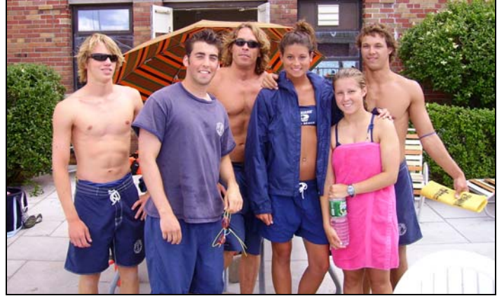
Part of the WBHP Crew on a sunny Sunday afternoon