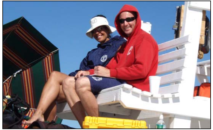
How come the nicest smiles come out when a camera's there?