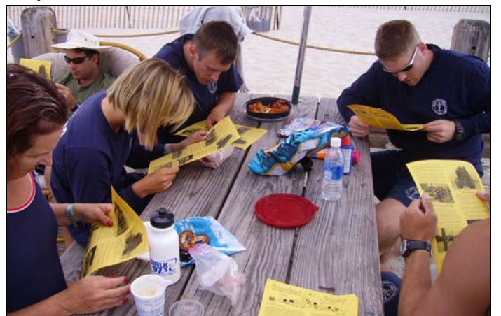
Pop Quiz; what is F 6's favorite Sunday morning newsletter?

I have CDO – It's like obsessive-compulsive disorder only it's in alphabetical order, as it should be