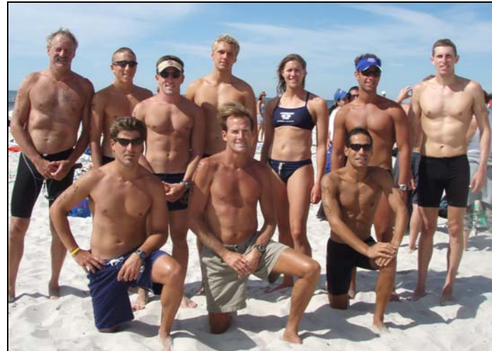
The JBLC makes a strong showing at this morning's Biathlon