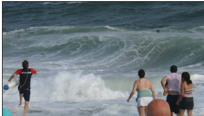
RM4 going in for a rescue last week

Next week: Bio's of new Executive Board Members and an in depth look at the proposed Constitution and By-Laws