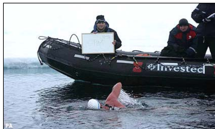
I think the sign says "If Reggie can do it, so can you!"

"It's a triumph and a tragedy - a triumph that I could swim in such ferocious conditions, but a tragedy that it is now possible to swim at the North Pole."