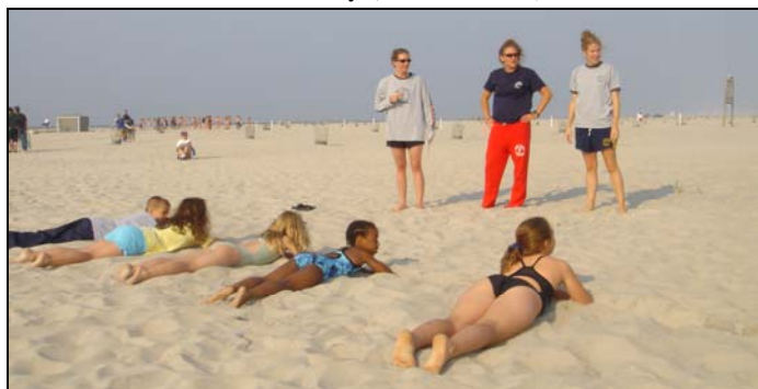
Last years' Juniors learning the art of Beach Flags