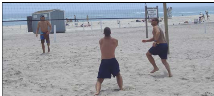
RM5 – The unofficial Volleyball Capital of the World

Questions? Contact me at scottdavern@yahoo.com . This tournament is reserved for JB Lifeguard Corp lifeguards only.