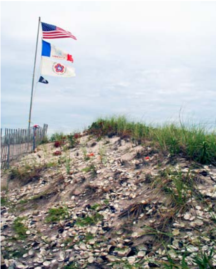
The Hill of Dead Clams, RM4