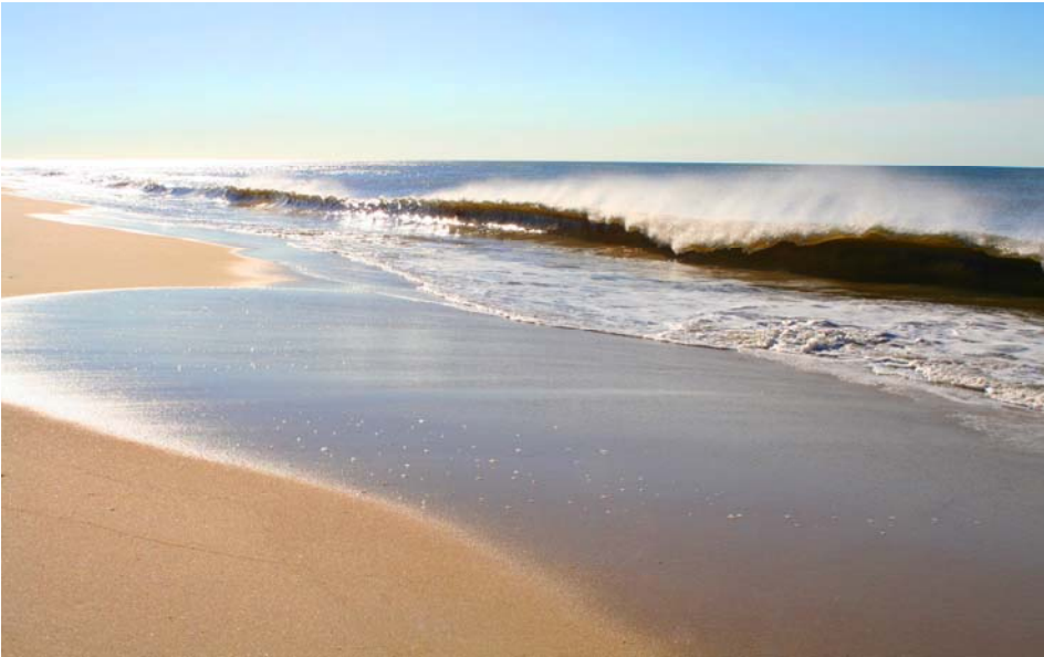
Winter Surf, Robert Moses