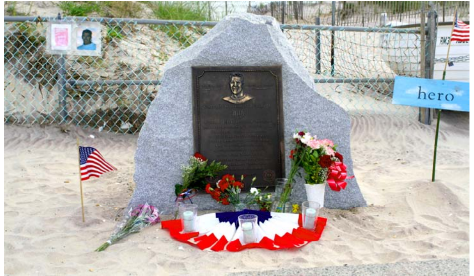
Billy Burke Memorial, RM3, 9/11/07 9/11 Memorial, Central Mall