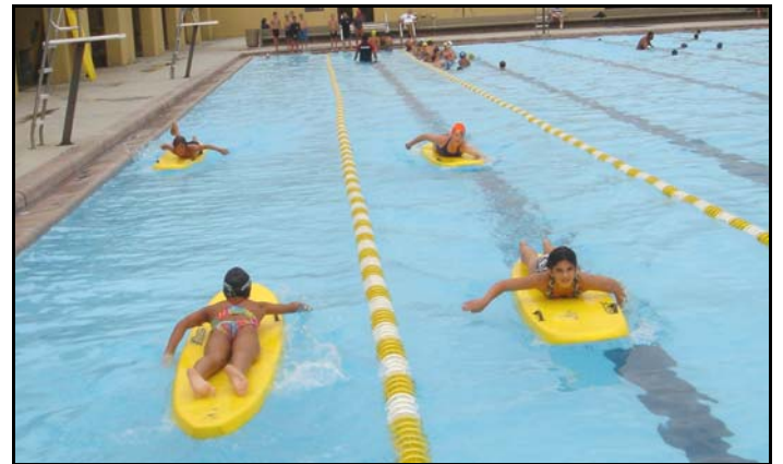
"Catch a wave and you're sitting on top of the pool"

The manufacturer Original Lifeguard (formerly Thousand Mile) then had the material shipped to China for cut and sewing, and the finished jacket and pants arrived earlier this week in Los Angeles. The goods are being shipped to NY to be screened with our logo, and hopefully will be here for distribution by mid August. Keep the faith - There is a chance yet for this summer!