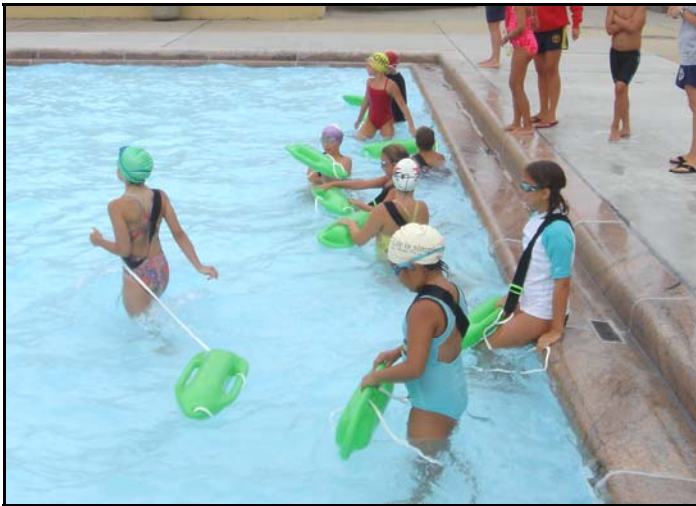
Mini Juniors learning the fundamentals of a buoy