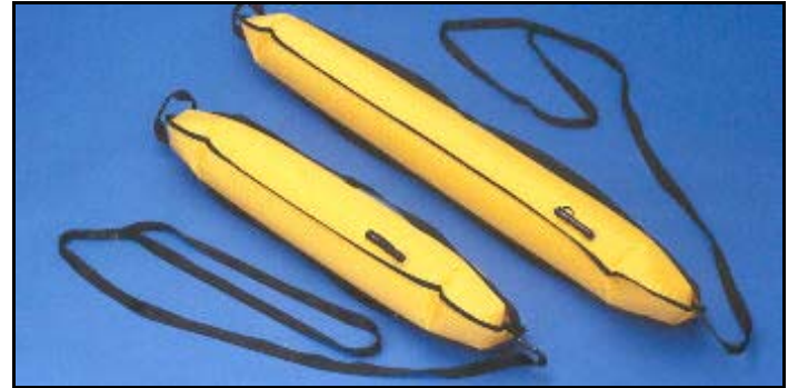
We're not just full of hot air when we brag about the buoy

Editor's note: Here are some statistics and the website, supplied by Bob Adler: Buoy is 34" long with 36 pounds positive buoyancy (compared to under 20 pounds for our foam buoys), Coast Guard approved materials, NO-pull back in big surf due to hydro-dynamic design, 1" flat webbing used throughout, 4 breath oral inflation, quick easy deflation for storage/travel - http://waterrescue.marsars.com/it050014.html