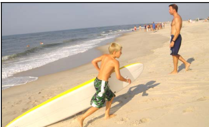
A very fast Jr paddler leads the pack in practice