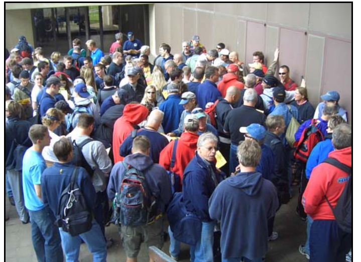
Waiting in line instead of filling out forms - ??Why??

For info call 516-698-8104 or e-mail - Seafire124@aol.com