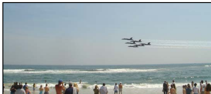
The Blue Angels and the much better Sunday show

Just a word of caution, however. The list that was distributed has a status attached to each person; (either part-time or full-time). Lately there have been calls to fields saying that some peoples' status has changed. Please make sure you get that in writing. We do not want to be in position of trying to defend someone who failed to show up because they were told their status was changed. Again, GET IT IN WRITING!