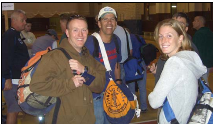
Notice the big confident smiles even before the swim