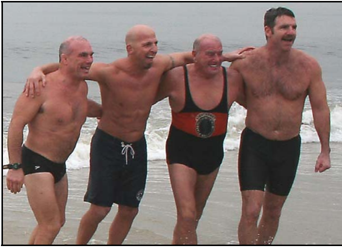
Here it is Jan. 1, 2006 and these nuts are in swimsuits???