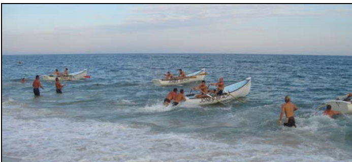
And they're off for a little red buoy far far far away