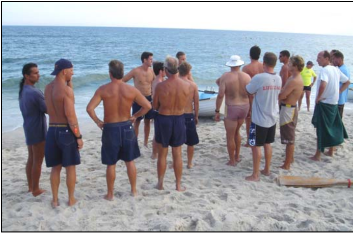
Last minute instruction before the launching of the armada