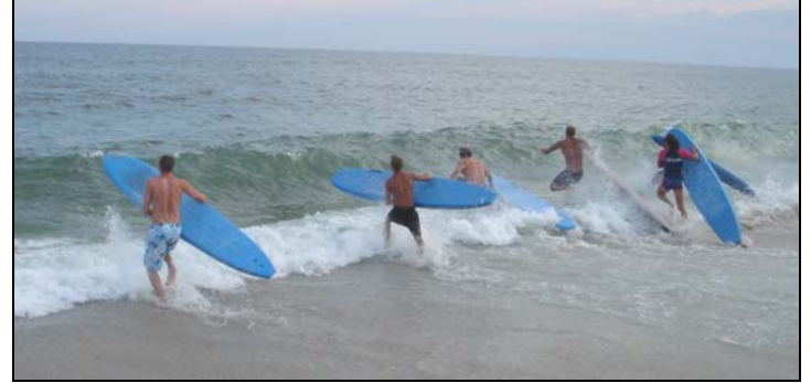
Starting the long surfboard relay in a solid shore break

As promised last week here is a report as to the distribution of the $5,010.00 special events money in our treasury. The food trays cost $836.50 to Terrace Deli, the balloons cost $72.72 to Party Magic, the wrist bands cost $32.58 to Party City, the DJ cost $200.00, the soda and cakes cost $194.47 to BJ Wholesaler and the beer cost $377.38 to Monarch Beverage. (not taken from the special event money). Still to be paid are awards for $480.00 and about $3,000 for T-shirts. Upon payment a final report will be issued.