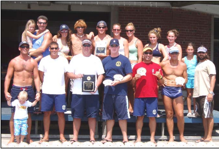
The Newport Team bringing honor and glory to the Corp