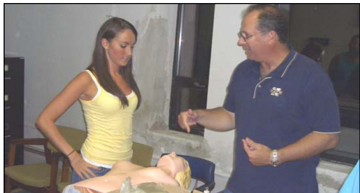
"How do I know it's a dummy – Take my word for it, I've had a lot of experience with dummies."