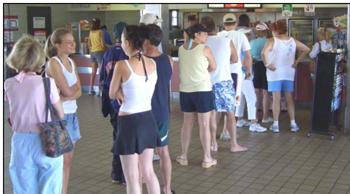
Good Morning - There will be a 15 minute wait for coffee