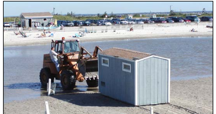
A scene from 2004's hurricane season as 2005's begins